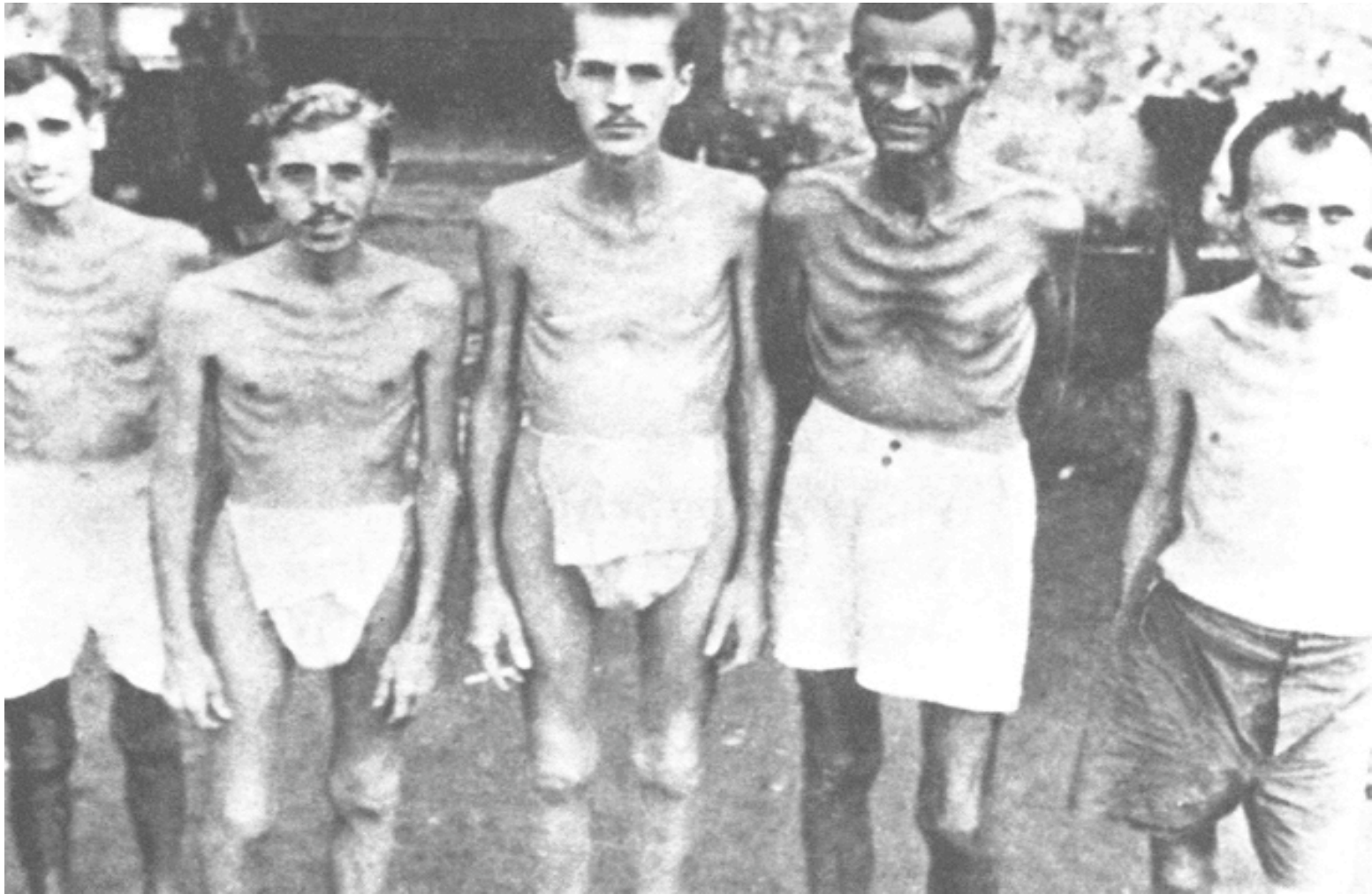
American Survivors of the Bataan Death March